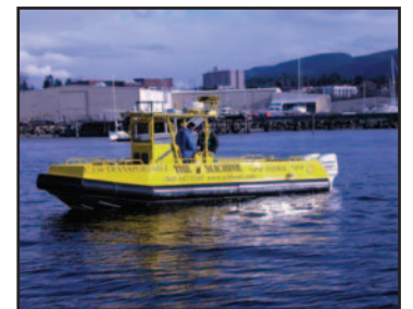
This brightly painted aluminum patrol boat will never rust, thanks to marine-grade aluminum alloys.

Extruded aluminum interior framing gives ACB boats their framework for success. "Using extruded structural components gives us the assurance of quality tolerances, not only for dimensioning but to easily monitor alloy control through supplied certifications," said Rick Benson, ACB fabrication and design superintendent. "It's imperative that our boats are always built the same, ensuring the quality, safety, and dependability that ACB boats are known for."