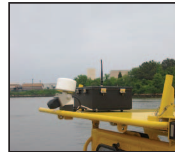
Left to right: This high-tech security control terminal aboard the USV can be operated manually, or via remote control for many different types of missions. • A laptop computer is a key part of the USV terminal station. • An omnidirectional antenna and video cameras are perched atop the USV. • This Global Positioning System (GPS) antenna and receiver relay are key elements of the USV's control system.

The USV's Tactical Command Kit adds capabilities via UHF, VHF, and satellite communications (SATCOM) through all the boat's performance/speed ranges, including manual or remote control, with on-the-fly shift at the controller's discretion; mission-specific sensor package includes radar, forward looking infra-red (FLIR), infra-red display system (IRDS), cameras, low light TV, sensor detects biological and chemical agents (called SNIFFER), radiation detection, and biologic detection. Towed or fixed sonar may also be used. Clear, detailed data is facilitated with a gyro-stabilized system.