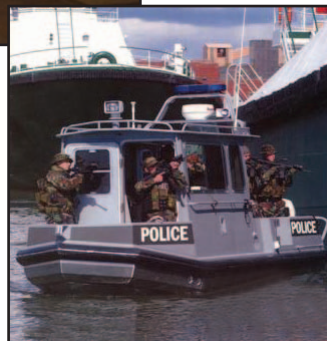
An ACB police boat shows its toughness while on patrol.

Aluminum extrusions' unique characteristics enable tougher hull construction to withstand impacts, achieving nearly 30 percent greater dent resistance. Dents are easily repaired, and damaged areas are quickly rewelded in sections, whereas fiberglass or steel can rupture severely and may crack or fracture on impact. Repair cost effectiveness is a major factor in keeping ACB boats in service, with minimal downtime. Unlike flammable petroleum-based resins in fiberglass boats, aluminum boats do not burn. Aluminum boat chambers provide structural compartmentalized fire protection, without separate firefighting systems.