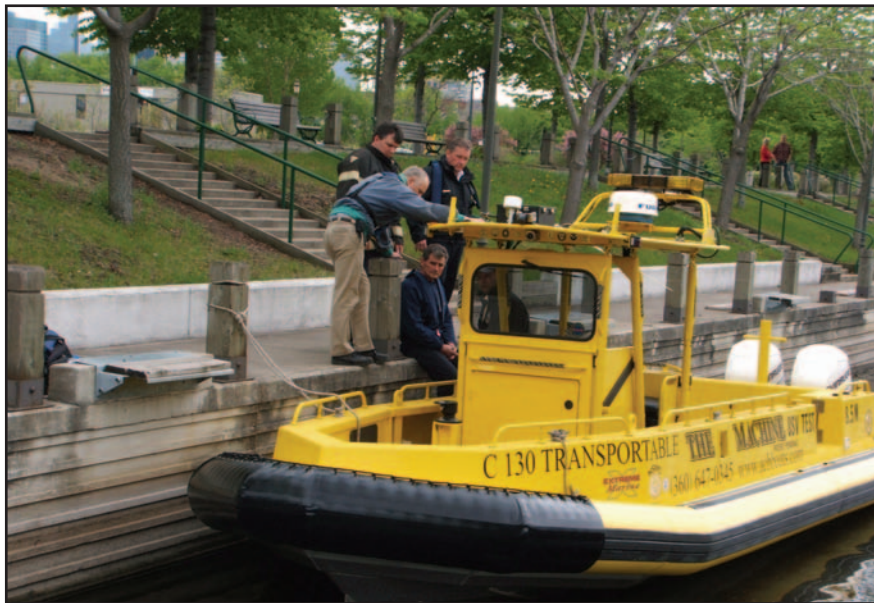
The remote control Unmanned Surface Vessel (USV) docks on the Mississippi River while on its maiden U.S. tour.

ACB has partnered with International Submarine Engineering (ISE) of Port Coquitlam, British Columbia, Canada, to create the Unmanned Surface Vessel (USV), the new high-tech security vessel designed for a wide range of missions performed in harbors, rivers, near shore, and deep ocean environments. The USV uses ACB's design and ISE's proven control system, which may be manufactured by ACB into a variety of mission-capable unmanned surface vessels.