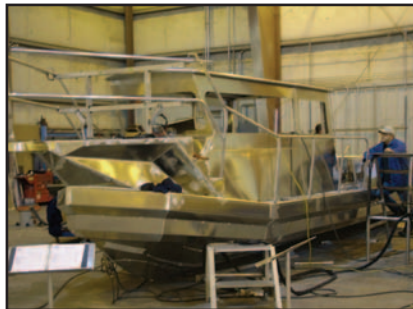
A V-shaped hull and aluminum chambers are assembled around extruded aluminum framing.