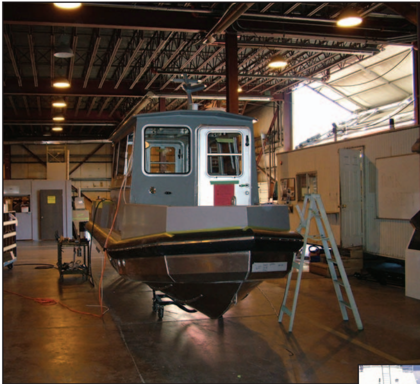
This DV-R Navy Special Warfare model awaits painting.

Aluminum Chambered Boats' chamber design uses three-sixteenths-inch-thick rolled aluminum alloy 5086 that is bent to form the chamber, then seam welded along its entire length using MIG (metal inert gas) welding on long continuous welds; TIG (tungsten inert gas) welding is used for the upper cabin assembly. Marine aluminum alloys weld easily, with hull plating accommodating pulse MIG welding using a computer to create controlled square wave pulses, forming high-strength hull integrity. Newer welding equipment uses less heat, minimizing distortion during joining, resulting in faster more controlled precision welds with less labor.