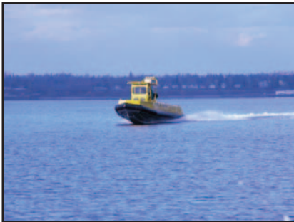
Swiftness and maneuverability are hallmarks of ACB's patrol vessels.

The test bed USV is a 26-foot center console model, featuring air-filled sponsons, multiple gun mounts and weapons capabilities, and multiple passenger/boarding team seating. The highly maneuverable USV is an unmanned or manually operated 55 mile-per-hour-plus pursuit craft, powered by twin 200-horsepowered V-6 outboard engines with a convertible canopy and transportable by C-130/Airlift. The USV has toured U.S. shores, demonstrating its prowess along the eastern seaboard, the Texas gulf coast, San Diego Bay, and along the west coast back to its home in Washington State.