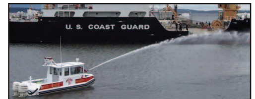
Fireboats like the Quantico Fire Boats are on duty from coast-to-coast.

The U.S. Navy, U.S. Marine Corps, U.S. Border Patrol, the National Oceanic and Atmospheric Administration (NOAA), and the Army Corps of Engineers are all using ACB aluminum boats to fortify security on United States shores. The U.S. Coast Guard has declared these aluminum vessels "virtually unsinkable." U.S. Congressman Rick Larsen (Washington State, District 2) notes, "For the communities I represent along the U.S. land and water border, homeland security also means personal security. Companies like Aluminum Chambered Boats make products that help keep our borders and our communities safer."