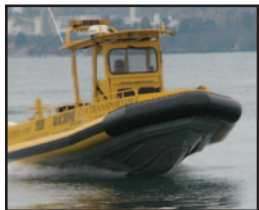
ACB's Center Console patrol boat features all extruded aluminum framing.

Aluminum Chambered Boats, Inc. (ACB) of Bellingham, Washington, is instrumental in helping the Department of Homeland Security meet the daily challenges of patrolling U.S. shores, safeguarding major port cities, and providing border patrols, military defense operations, as well as national and local law enforcement disaster preparedness. ACB's aluminum boats are used to protect the U.S. coastline around-the-clock, handling rough seas where their extruded aluminum framing provide the safety, endurance, and high performance critical to the boats' reliability and rapid response.