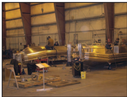
ACB personnel weld aluminum extrusions to form the internal framing of the vessel.