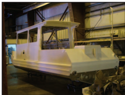
The painting phase is complete on this DV-R boat's exterior.