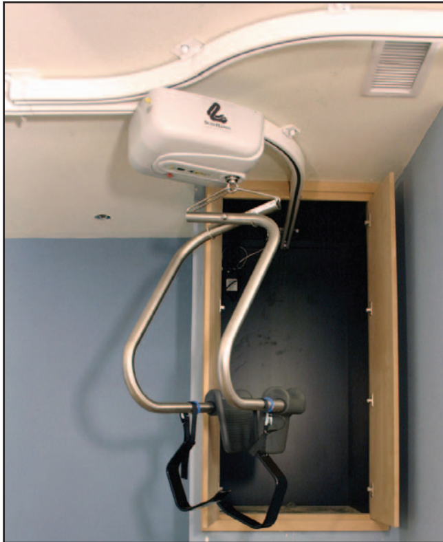
This customized SureHands HM2500RC motorized lift system operates by wireless remote control.

new home for the January 2005 episode of the popular ABC-TV reality show Extreme Makeover: Home Edition .