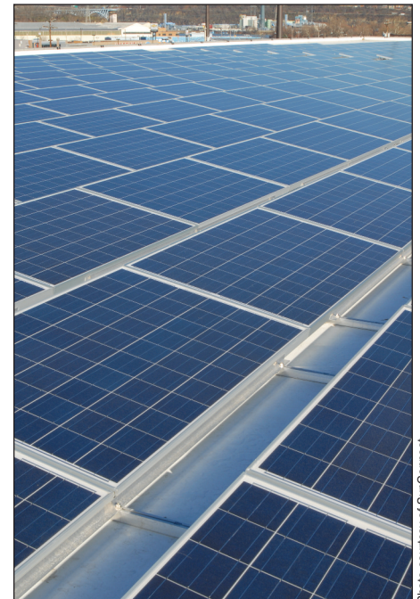
Commercial flat-roof top system