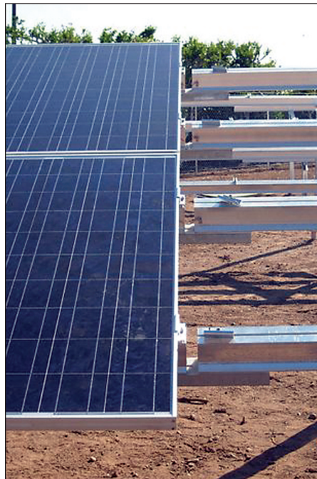
Small utility-scale ground mounted system

Three specific cost factors were considered: system components (rails, footings, clamps, etc.), fully burdened installation labor, and shipping costs. Cost of land and site preparation was not considered in ground-mounted scenarios.