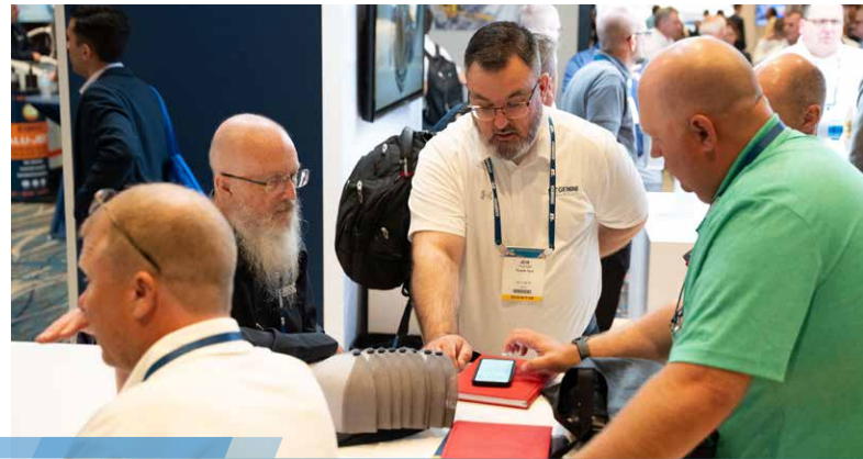
Exhibit at ET Expo

Held in conjunction with the ET Seminar, ET Expo is the marketplace and information center where providers of extrusion-industry products and services connect directly with decision-makers representing every aspect of the aluminum extrusion business.